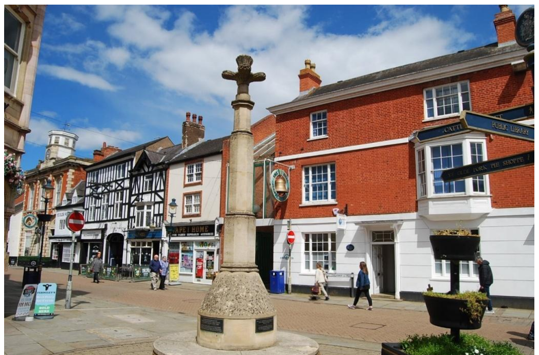
The town centre