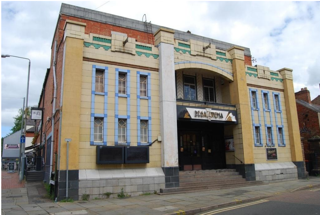
Art Deco Regal Cinema