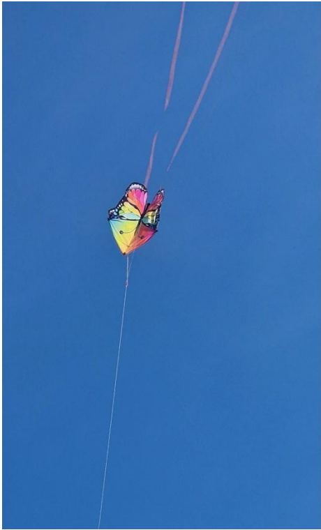
Let's go fly a kite