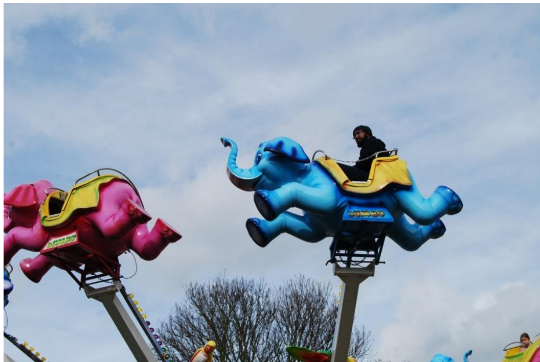
At a fun fair in Abbey Park there were rides taking passengers high in the air and then swooping down. This was a relatively tranquil option.