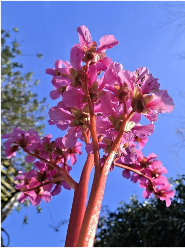
Bergenia flowers from Irene Ault