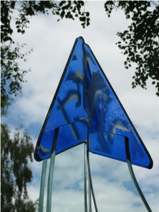
A sculpture from the Botanic Garden in 2023 and the top of a children's climbing frame near Belgrave