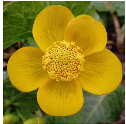
Beneath The Trees Jean Burbridge